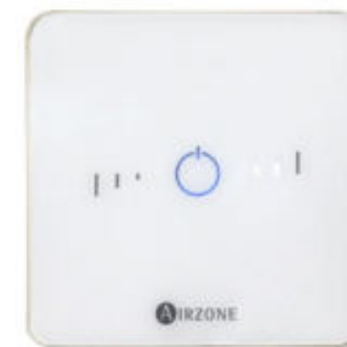
Thermostat for UFH in bathrooms