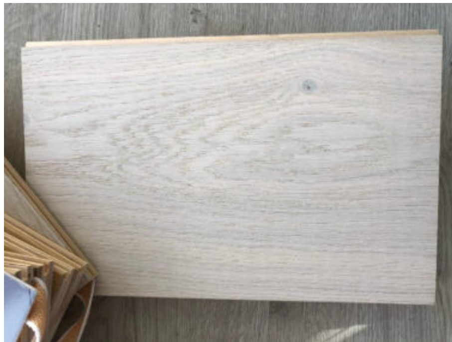
A. Wooden floors: these will be applied just in all spaces of 1F, except bathrooms. The model is from Parquet Astorga, from the collection Lisboa Natur, ref 2020/86.