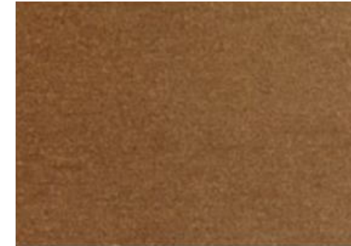
F. Decorative wood columns from Disegna, model Bastone, in Coffe finish, just in terrace at 1F