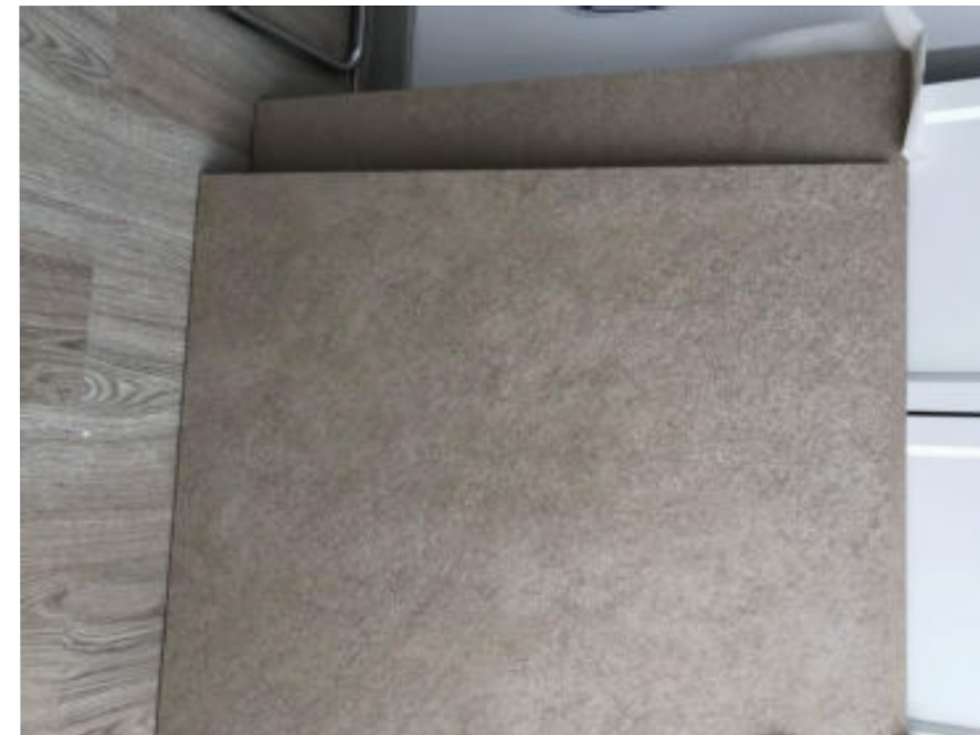
B. Porcelanic floors: applied in the rest of the interior and exterior spaces of the villas. The model is NaturBeige, 90x90 cm.