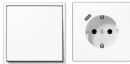
Mechanisms are from JUNG LS990 Blanco Alpino

O. Laundry doors are 22mm soft touch laminate with recessed handle in White colour. Laundry worktop is 2cm Silestone “White Storm Pulido” (front is not included). Sink and tap in chrome