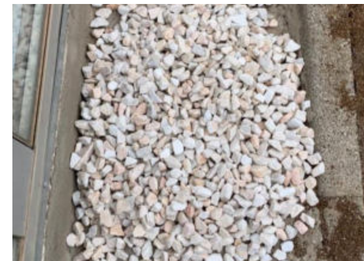
H. White round stones for non accessible roofs