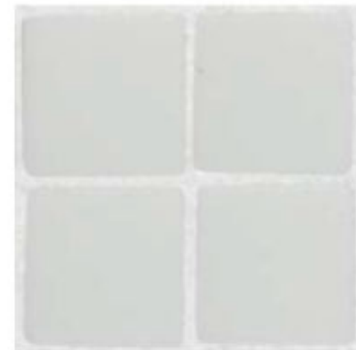
D. Gresite: Ederglass blanco 99A.