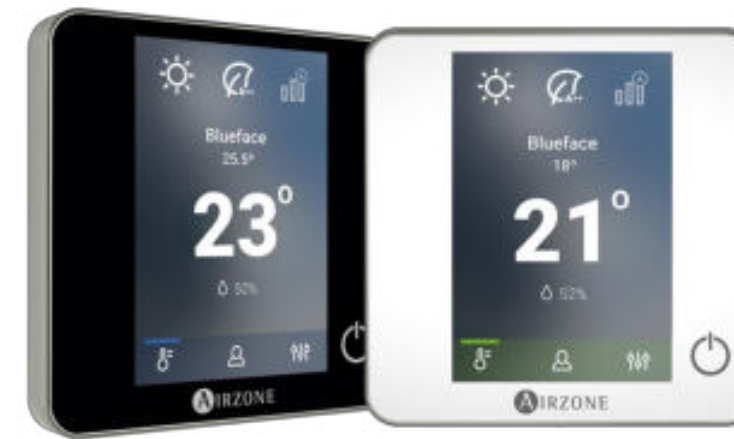
Thermostat for AC and UFH in all rooms (except bathrooms)

Q. Walls (interior and exterior) are painted in RAL 9010.