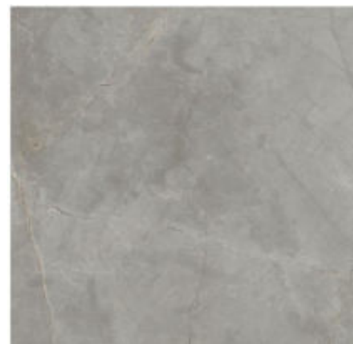
C: Porcelanic cladding: this is the material to be applied on the surface of the showers. The model is JW16 Raymi SLK of 120x278x6mm from the brand Cerafino.