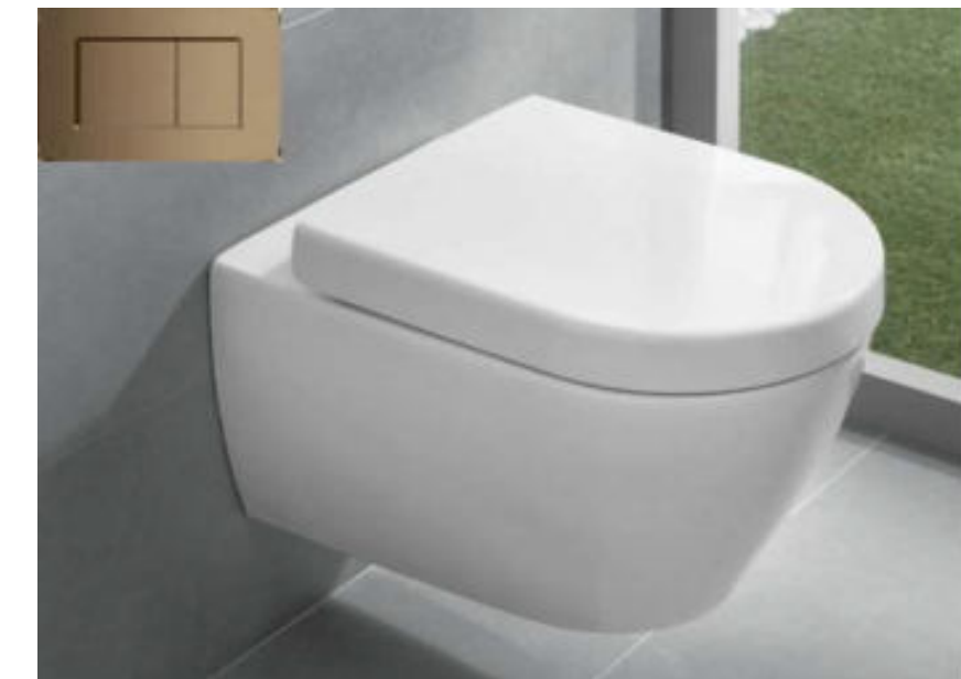
N. Toilet is from VILLEROY & BOCH - Subway 2.0, with Iconico flush plate (same finish as taps)

L. Bathroom taps are from Iconico, Collection A. Finishes are brushed copper in master bathroom and guest toilet, and chrome in the rest.