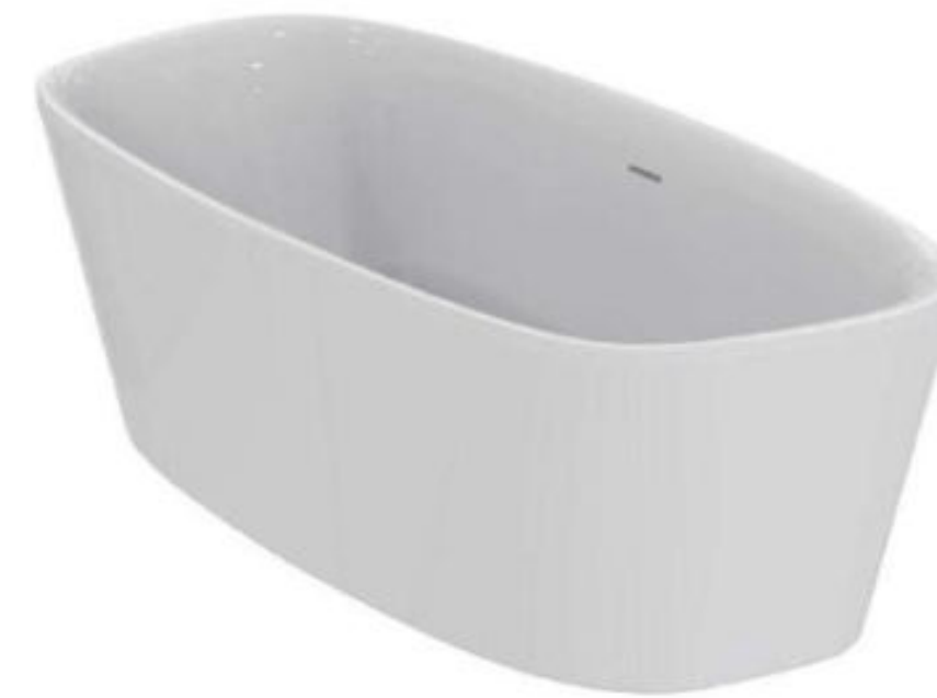
M. Bathtub is from Ideal Standard, model DEA, 1700x750mm