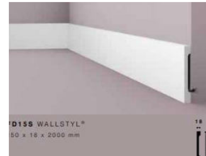
G. Skirting boards are waterproof, with measures 150x12mm in RAL 9010 (like walls)