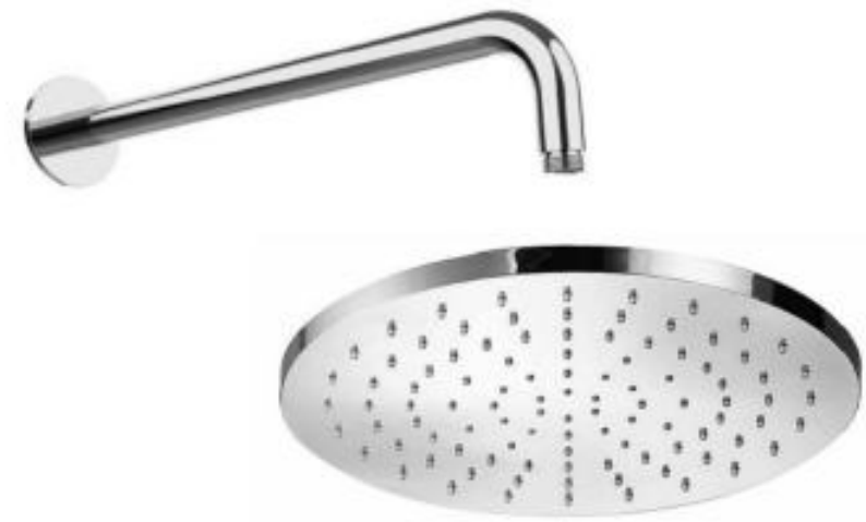
Shower head and wall fixtures