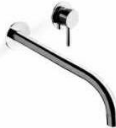
Wall sink tap