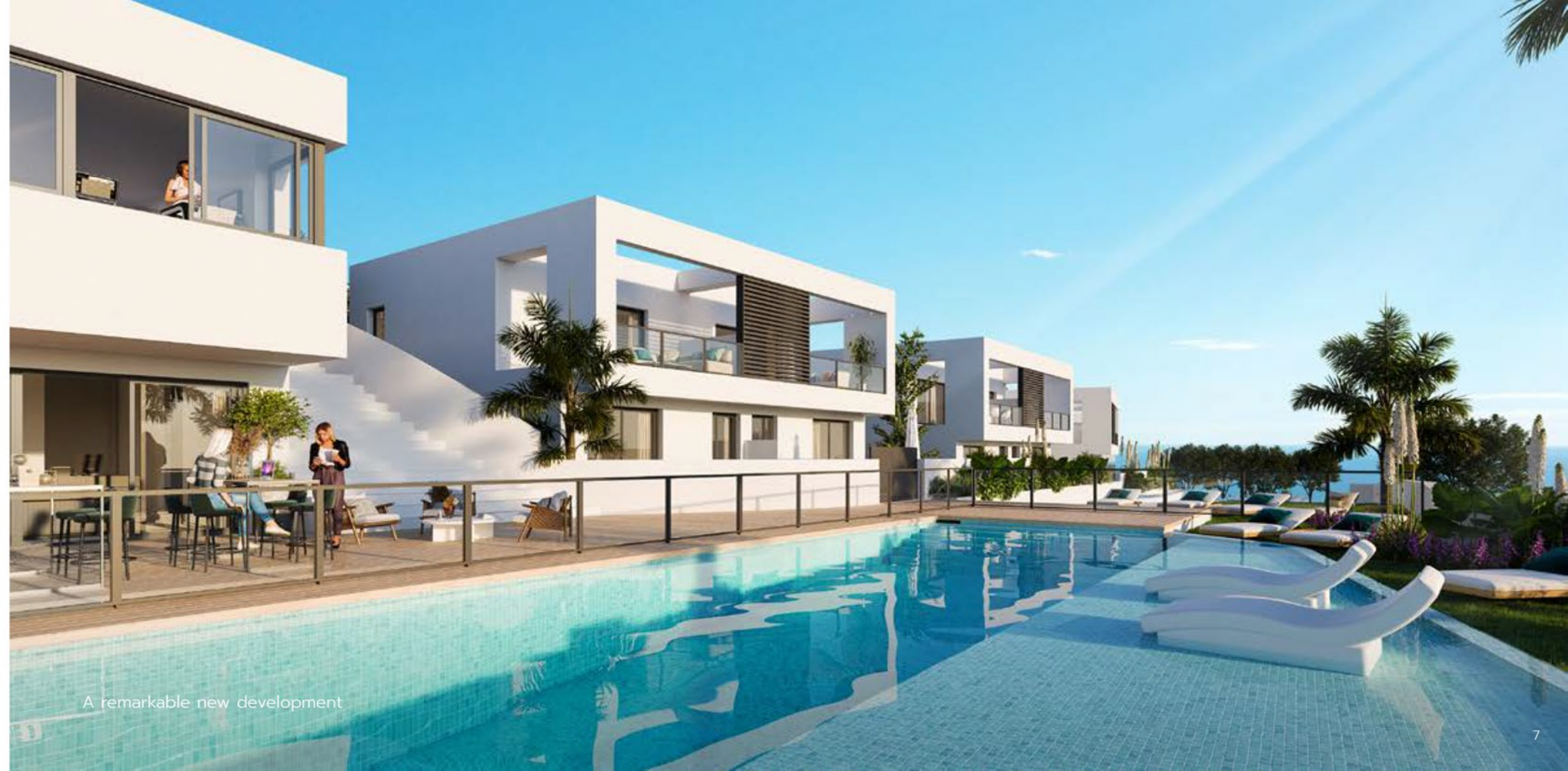
A remarkable new development

Each home has been designed with quality and comfort in mind, and the outdoor space is ideal for enjoying the Costa del Sol's Mediterranean climate.