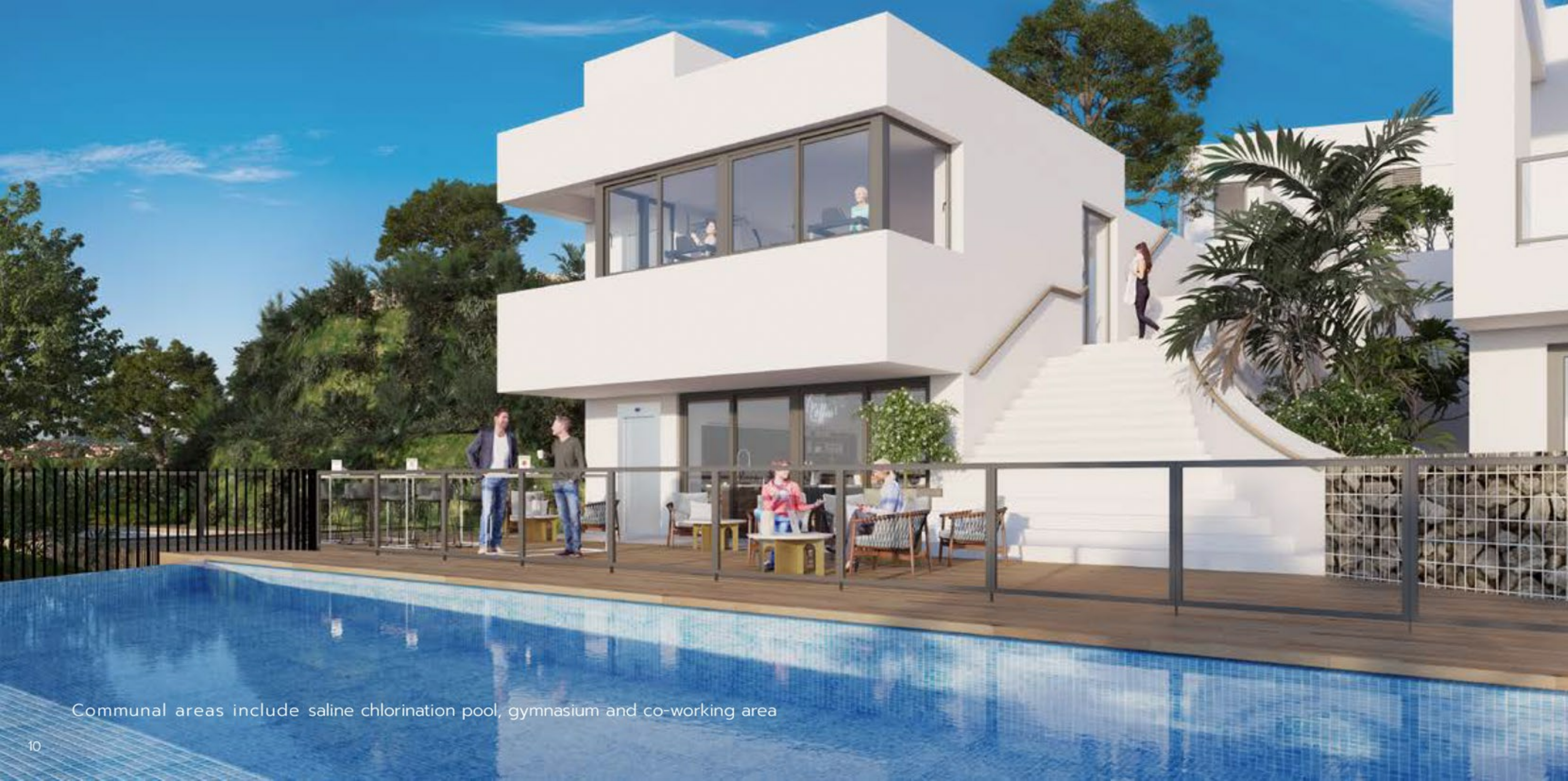
Communal areas include saline chlorination pool, gymnasium and co-working area

The communal areas include a saline chlorination pool with night lighting, gymnasium, co-working area, landscaped garden areas and electric vehicle charging facility.