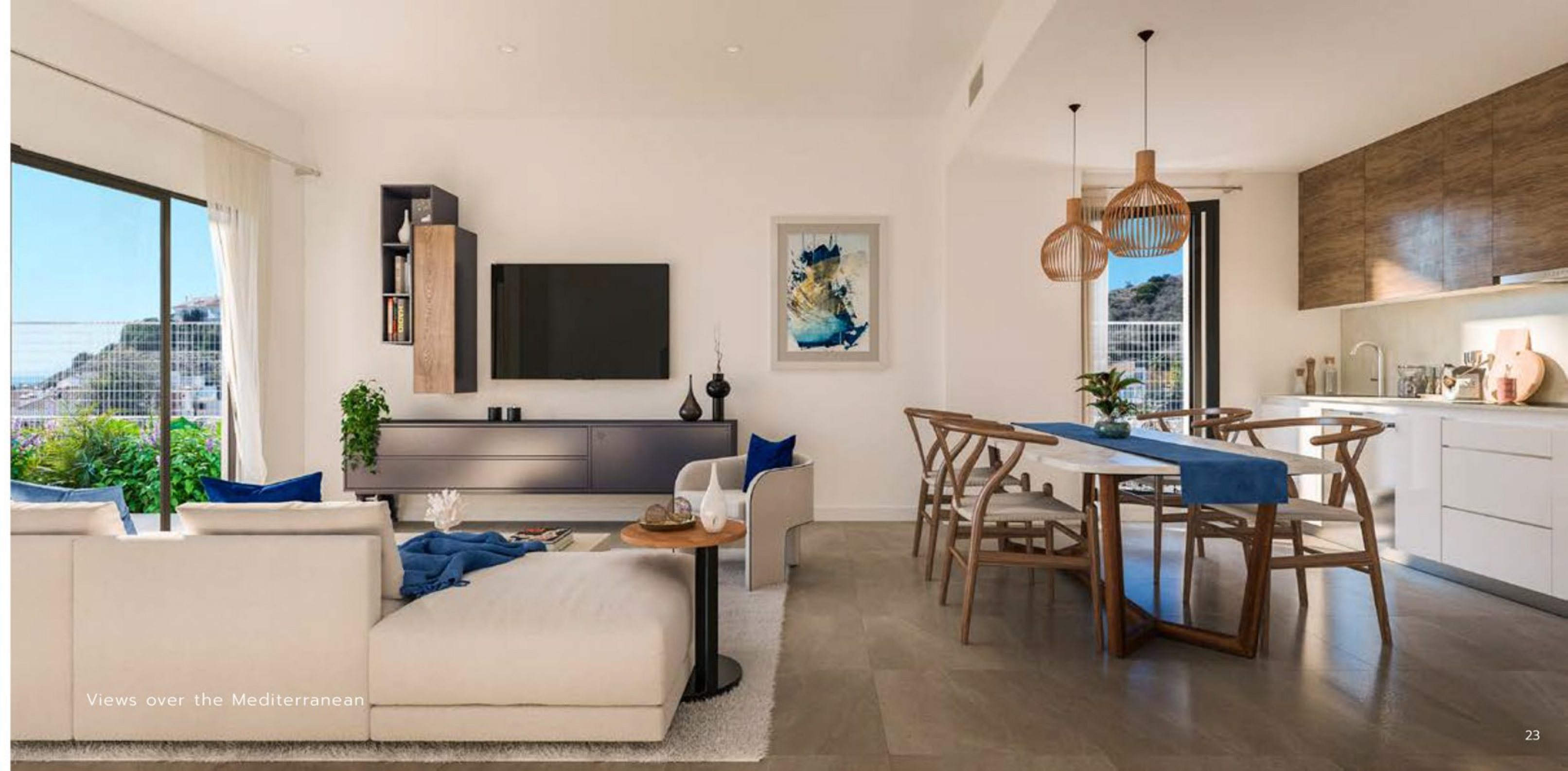
Views over the Mediterranean

The attractive stretch of coastline offers trendy waterfront bars, beach clubs, and an array of water sports. There are numerous golf courses in the vicinity including the Miraflores Golf Club which is situated next to Riviera del Sol. The Calahonda and Cabopino courses are also close by, as is the Mjas Golf Complex.