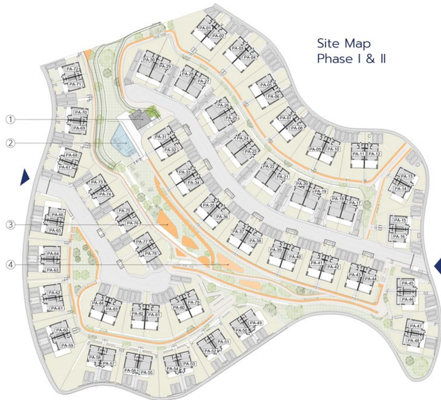
Site Map Phase I & II