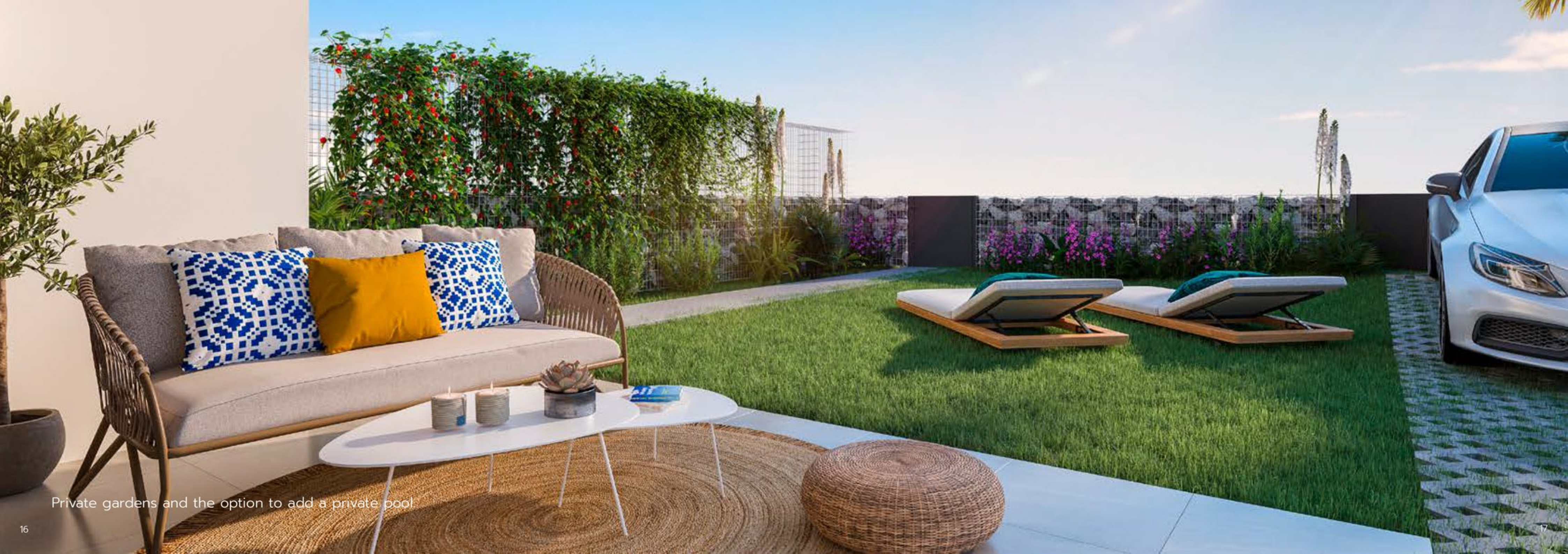
Private gardens and the option to add a private pool