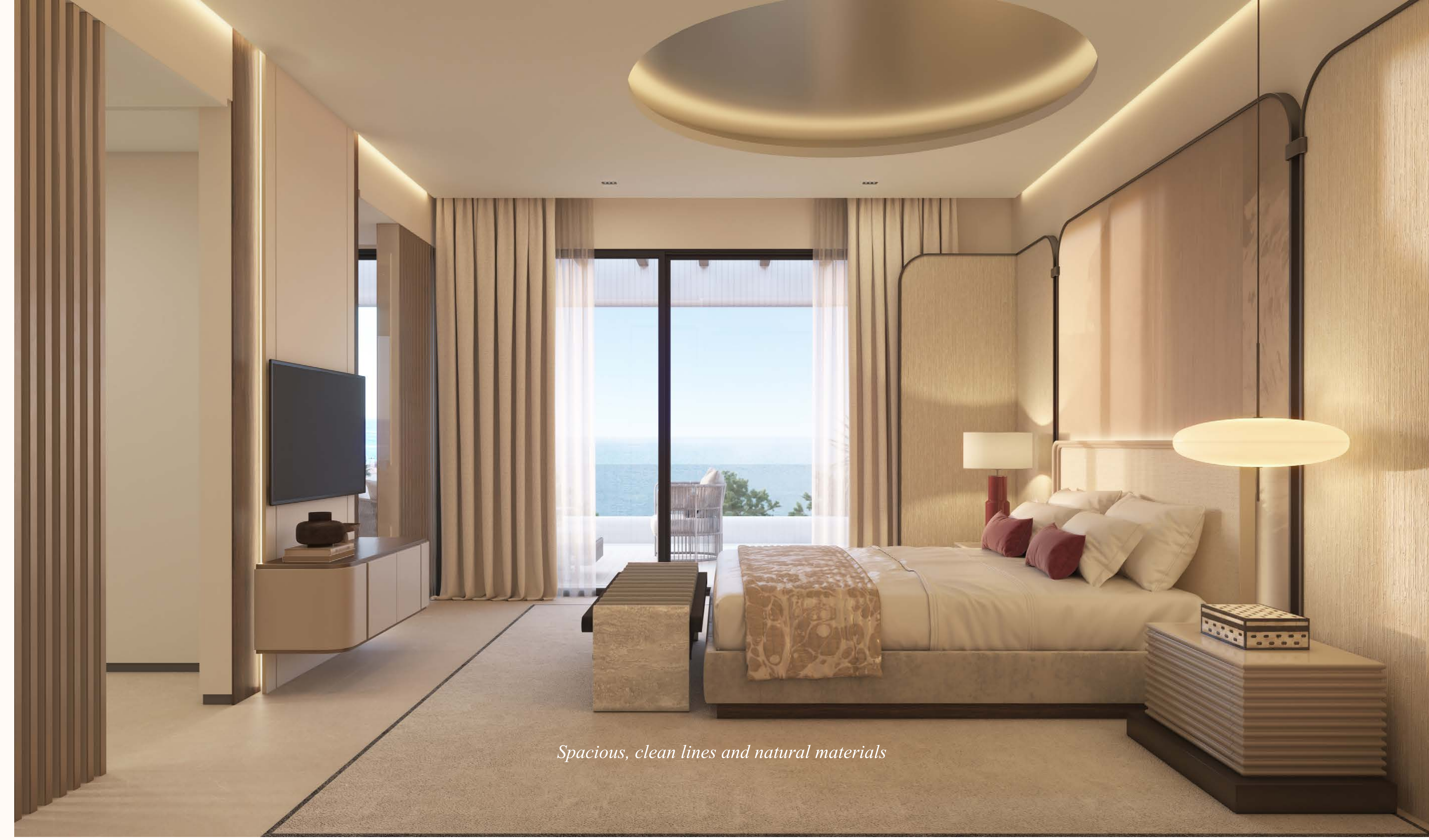
Spacious, clean lines and natural materials