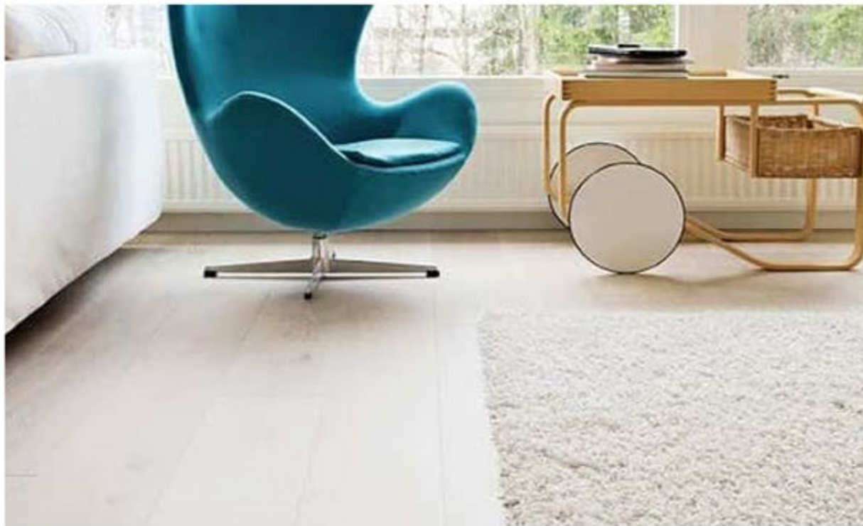
Non-contractual, non-binding advertising image.

“The overall look of the Vintage grade is stunning, rugged and rustic.”