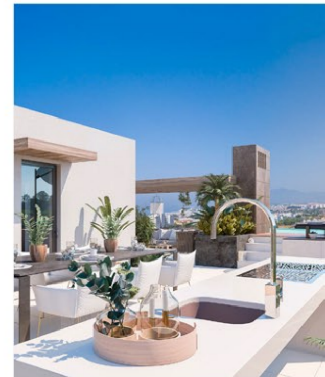
Non-contractual, non-binding advertising image.

The project management reserves the possibility of substituting the materials for others of the same or higher quality.