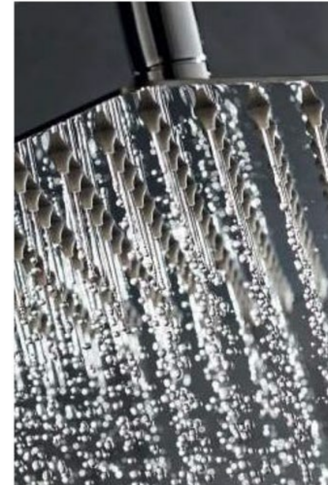
Non-contractual, non-binding advertising image.