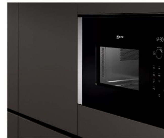
Non-contractual, non-binding advertising image.