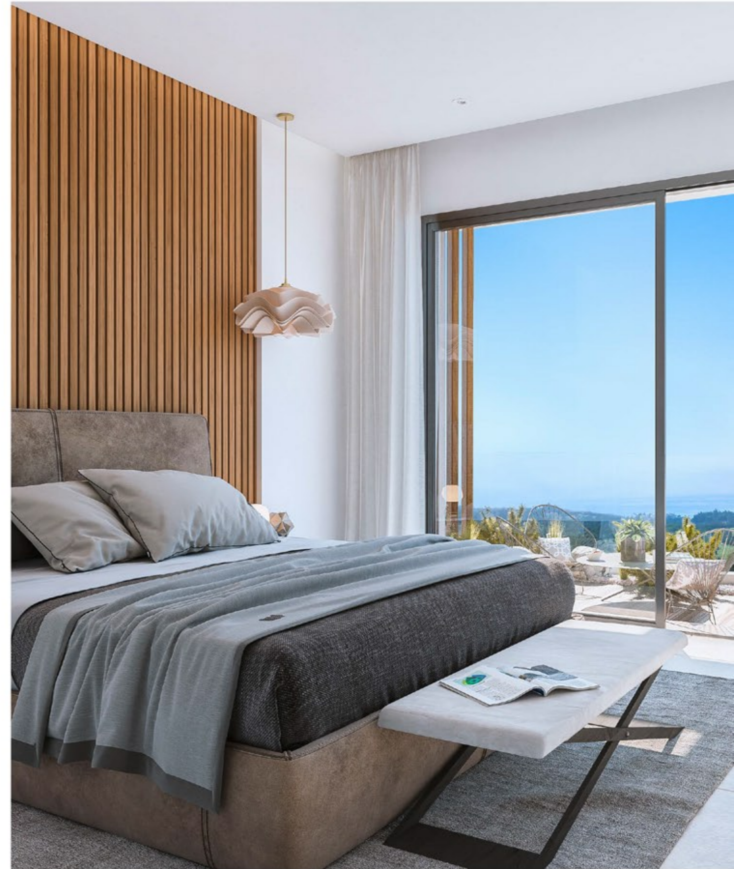
Non-contractual, non-binding advertising image.