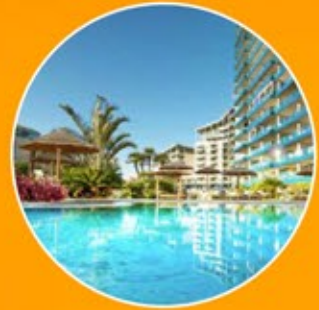
ROYAL OCEAN PLAZA