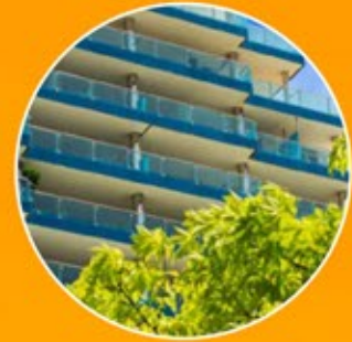
GRAND OCEAN PLAZA