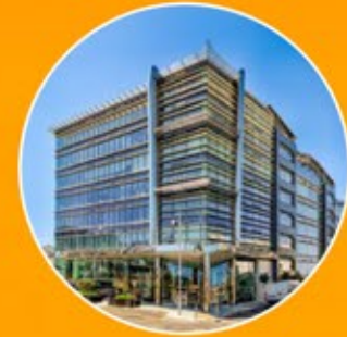
WORLD TRADE CENTER GIBRALTAR