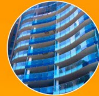
IMPERIAL OCEAN PLAZA