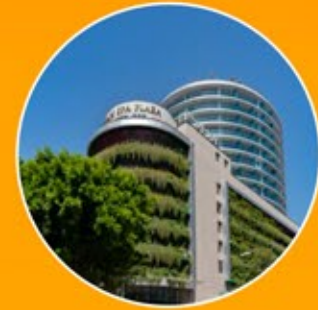
OCEAN SPA PLAZA