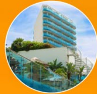
MAJESTIC OCEAN PLAZA