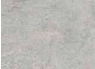
Persa Silver 100x100