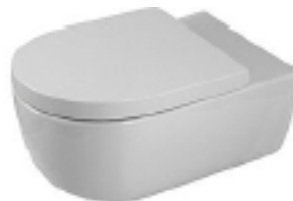
INO. ACRO COMPACT SUSP. RIMLESS 54CM