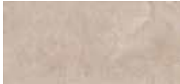
Persa Natural 31,6 x 90