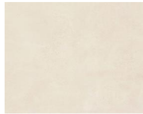
Vela Natural 100x100