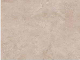
Persa natural 100x100