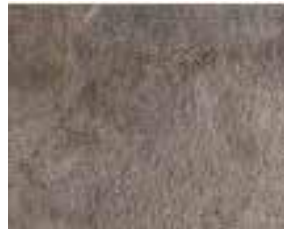
Airslate Delphi BTP 250x120