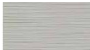
Limit Persa Silver 31,6x90