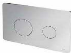
NO. ACRO COMPACT SUSP. RIMLESS 54CM