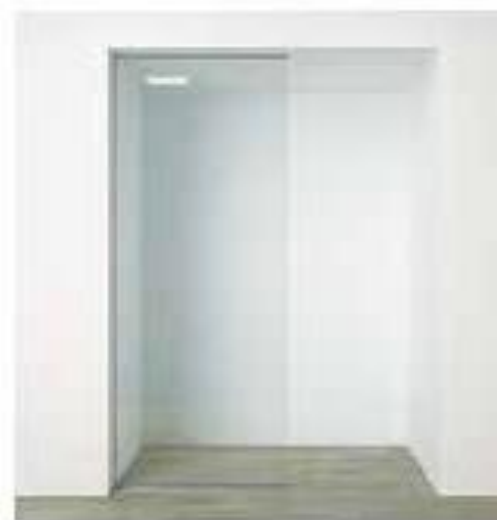
Tec Round thermostatic chrome column optimal screen chrome