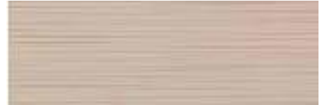
Limit Persa Natural 31,6x90