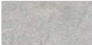
Persa silver 31,6 x 90