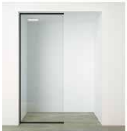
Tec Round thermostatic black matt column matt black optimal screen