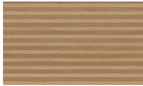
Deco Bremen Roble Natural 31,6x90