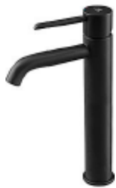
MONM. Round Caño alto 306 mm BLACK