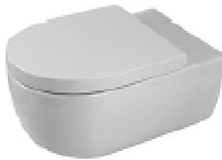
INO. ACRO COMPACT SUSP. RIMLESS 54CM