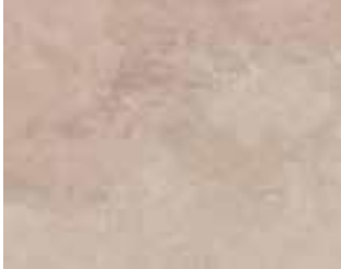
Persa Natural 100x100 Persa Natural 31,6 x090