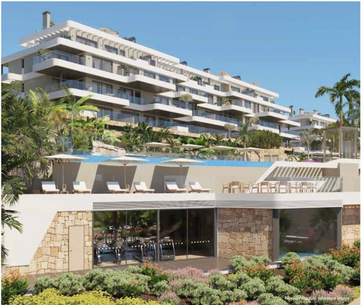
Non-contractual reference image