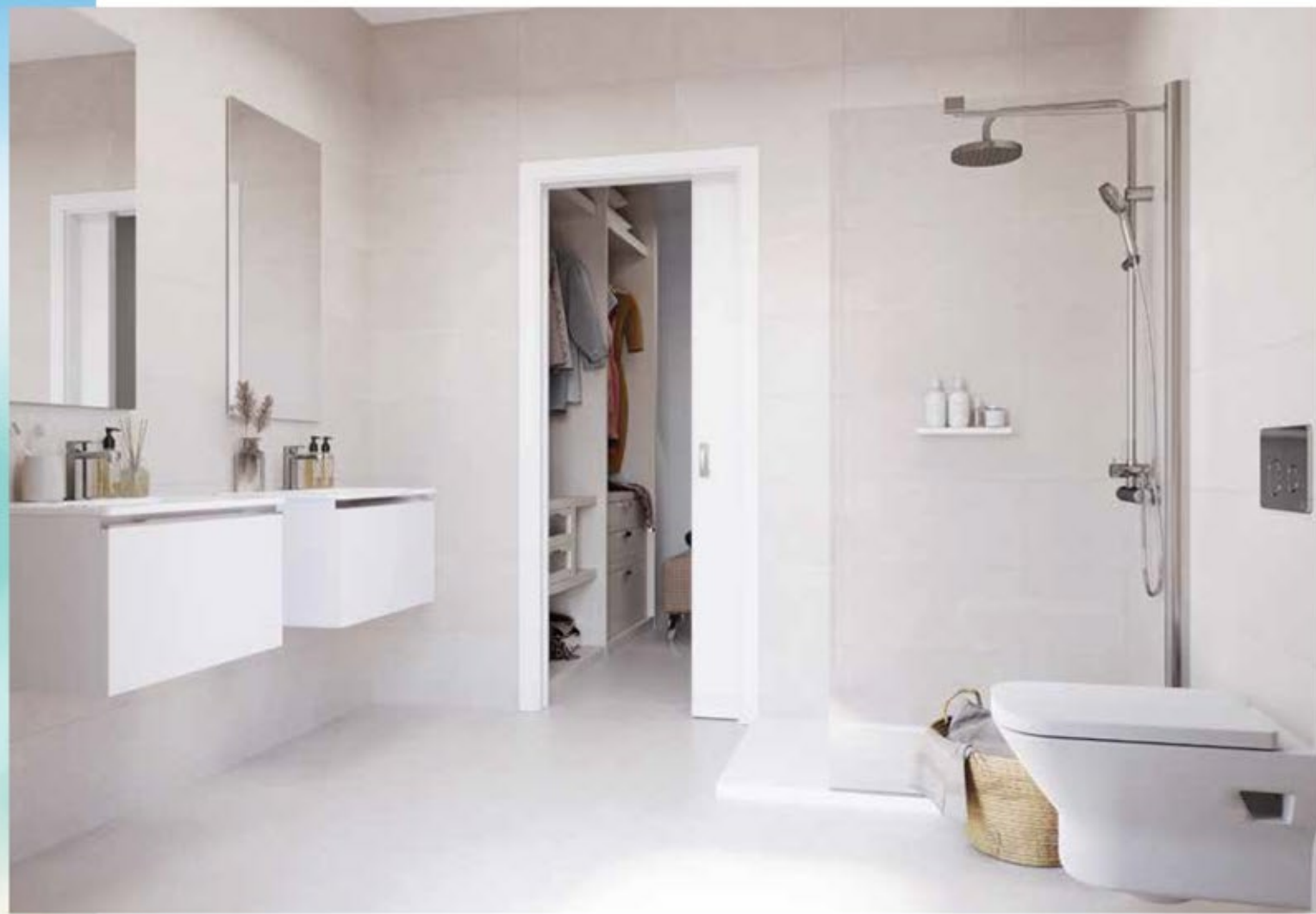
Master bedroom with walk-in closet, en-suite bathroom and lovely sun terrace with sea views.