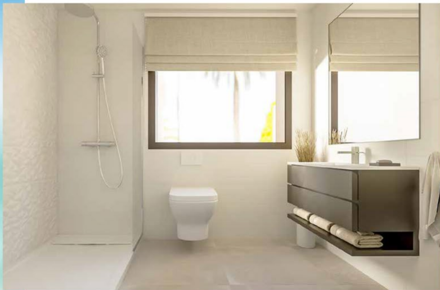
Luxurious guest rooms with private bathrooms.