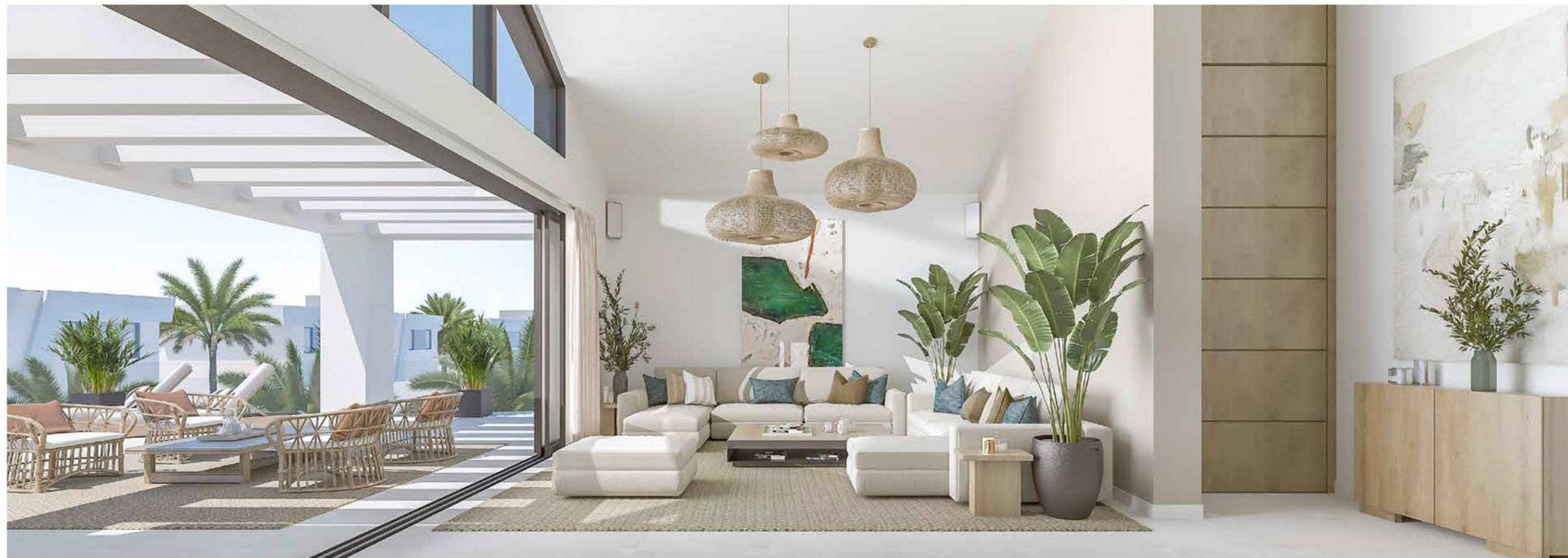
Spacious open interior areas for all year round comfort.