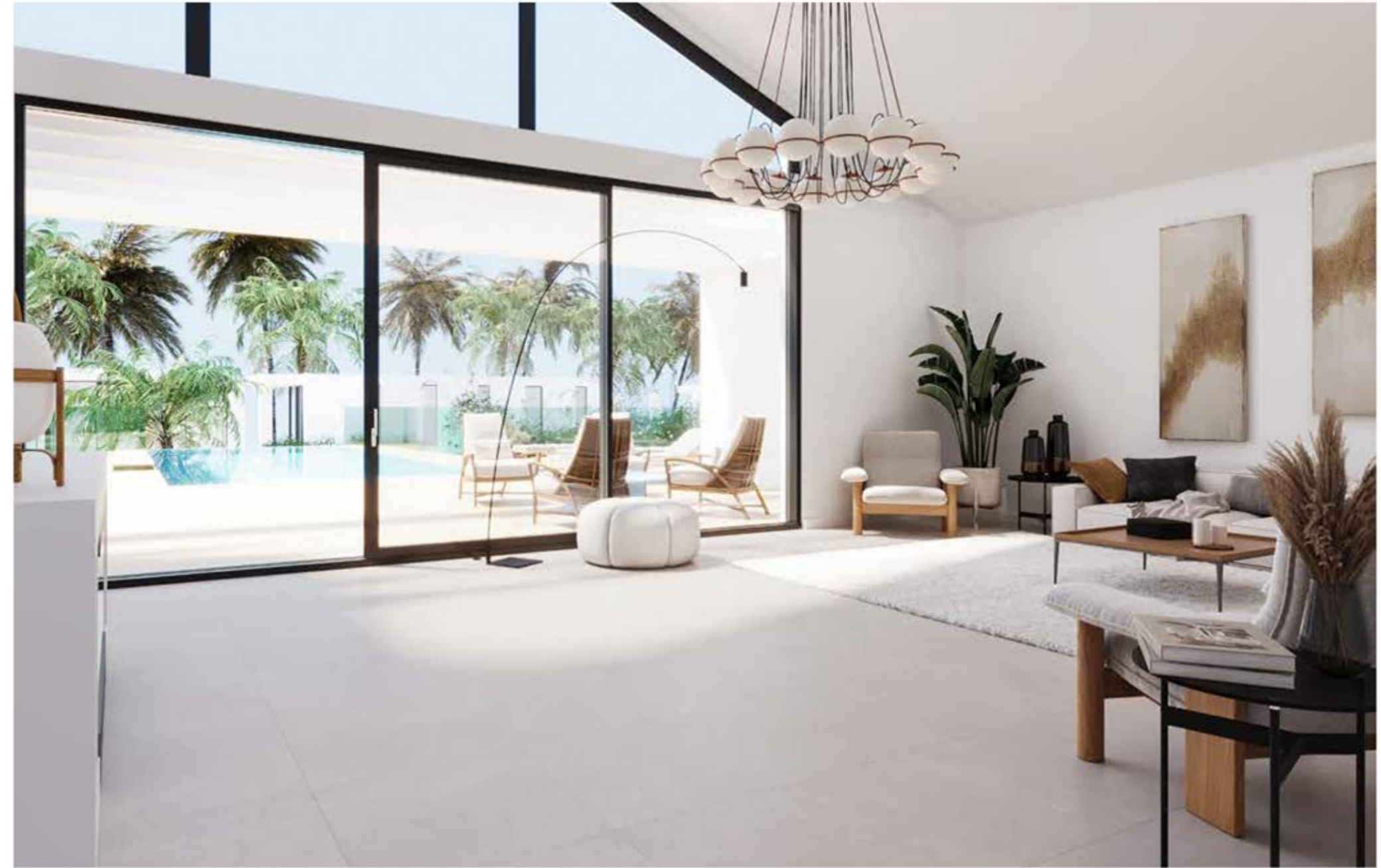
Huge floor to ceiling windows offering an abundance of light.