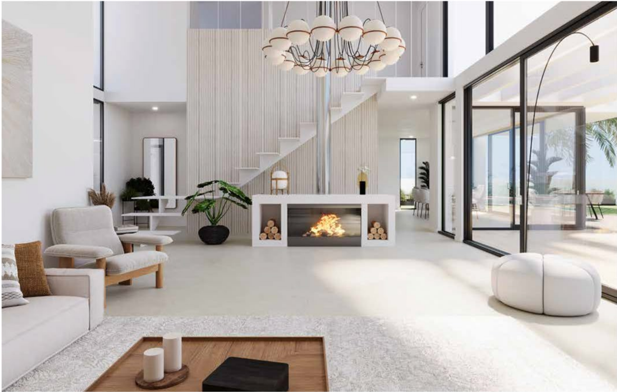
Livingroom with double height vaulted ceiling and feature fireplace.