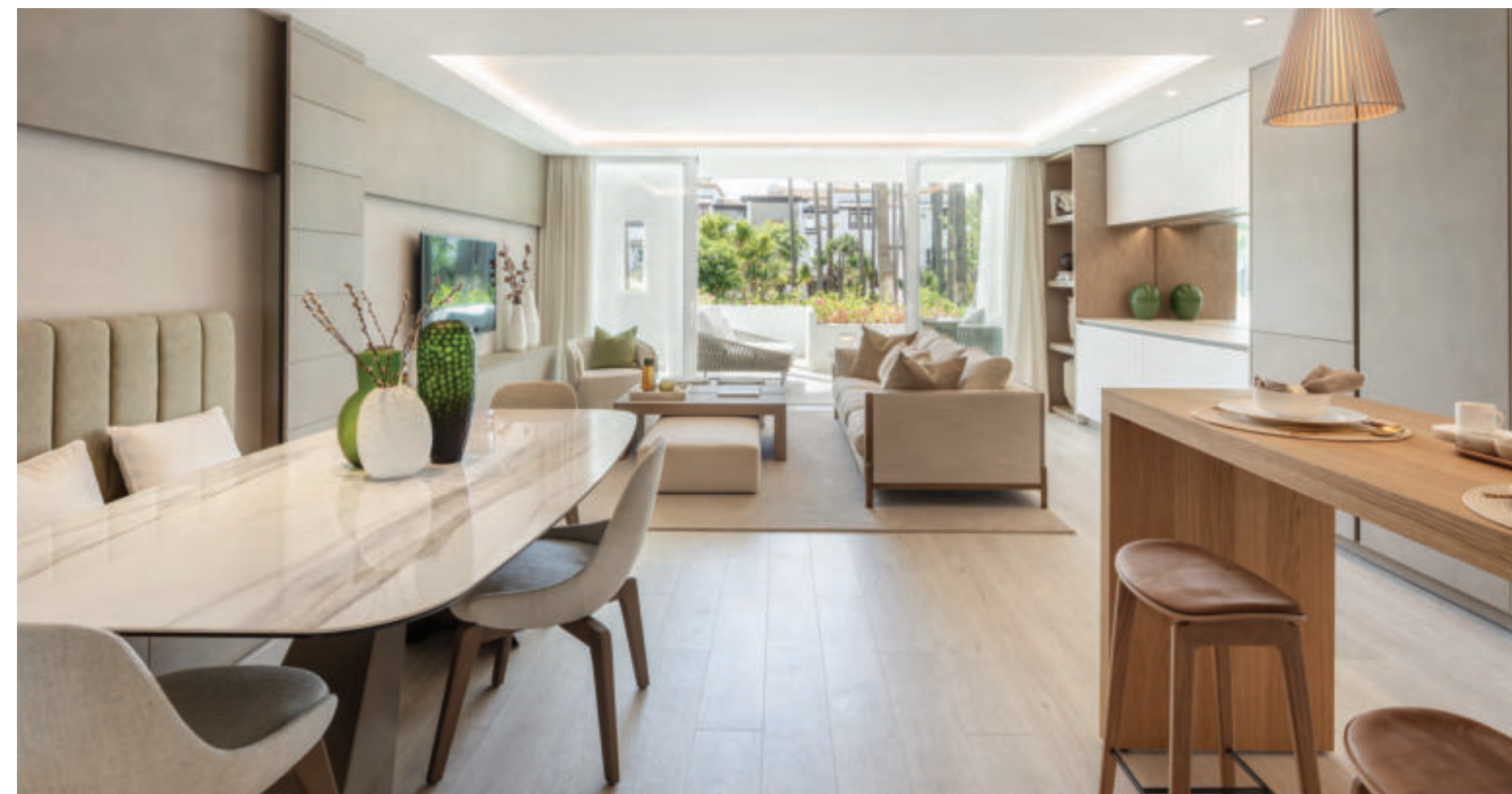
The living space is open-plan, seamlessly integrating the living, dining and kitchen areas for a sense of flow and spaciousness.