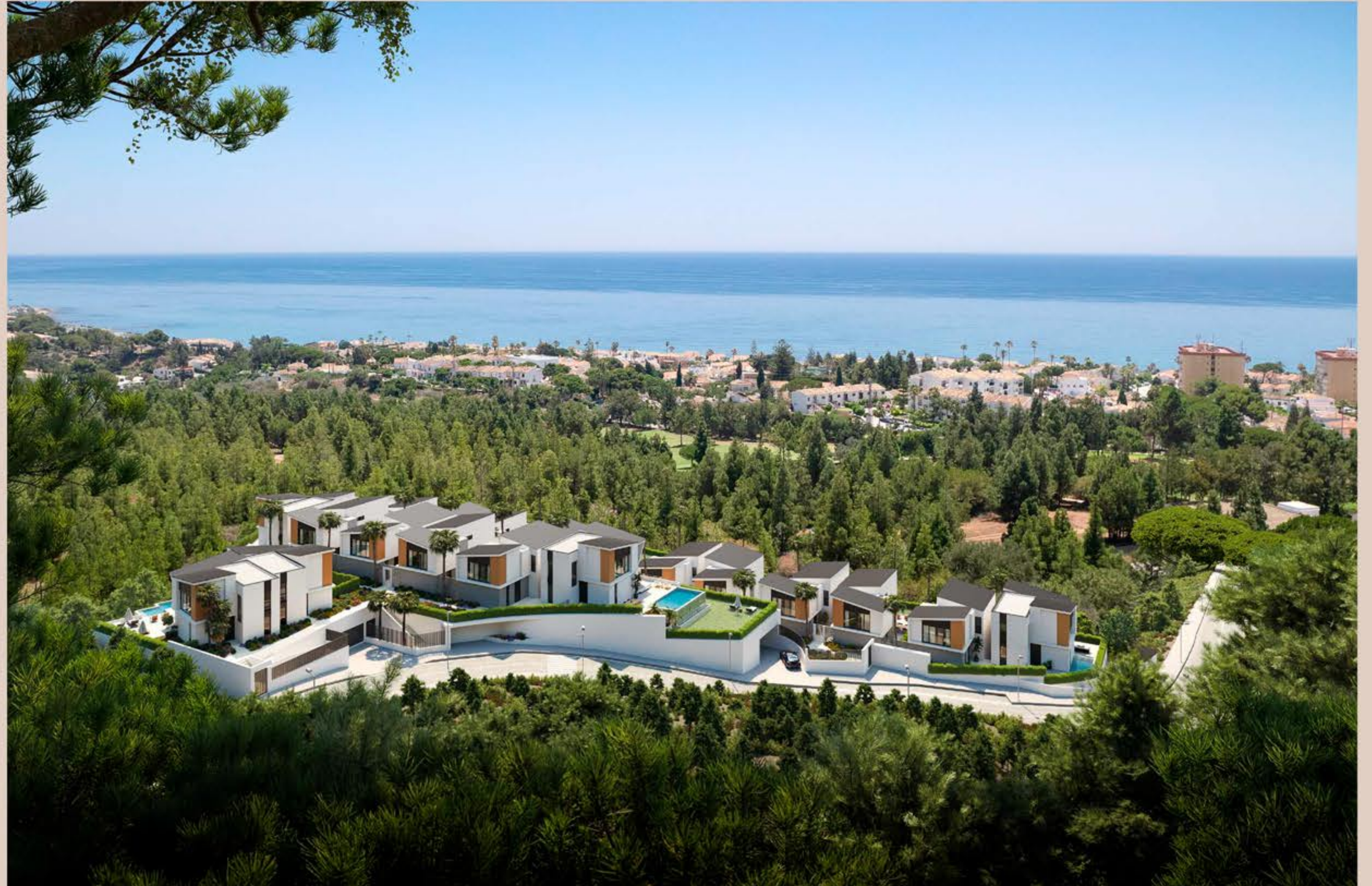
RH Privé, as the leading eco-developer on the Costa del Sol, launches with Pine Valley Villas its first project in Reserva del Chaparral.