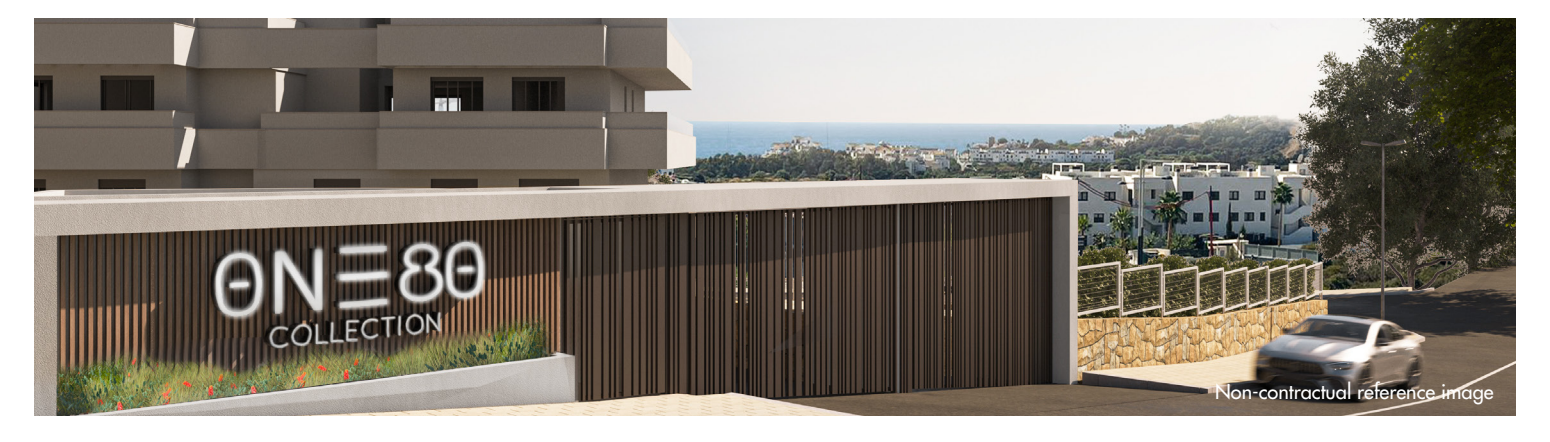
We build in compliance with the Technical Code for Construction and applicable regulations.

The Project's energy efficiency label will be available prior to signing the property purchase agreement