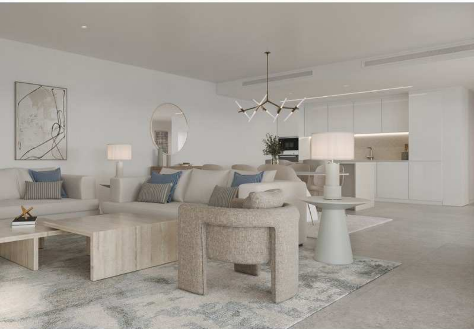
Urban option in the lounge