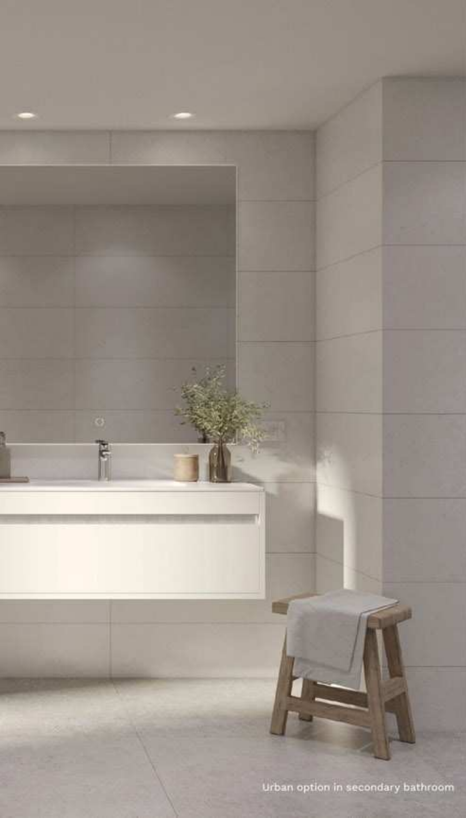
Urban option in secondary bathroom