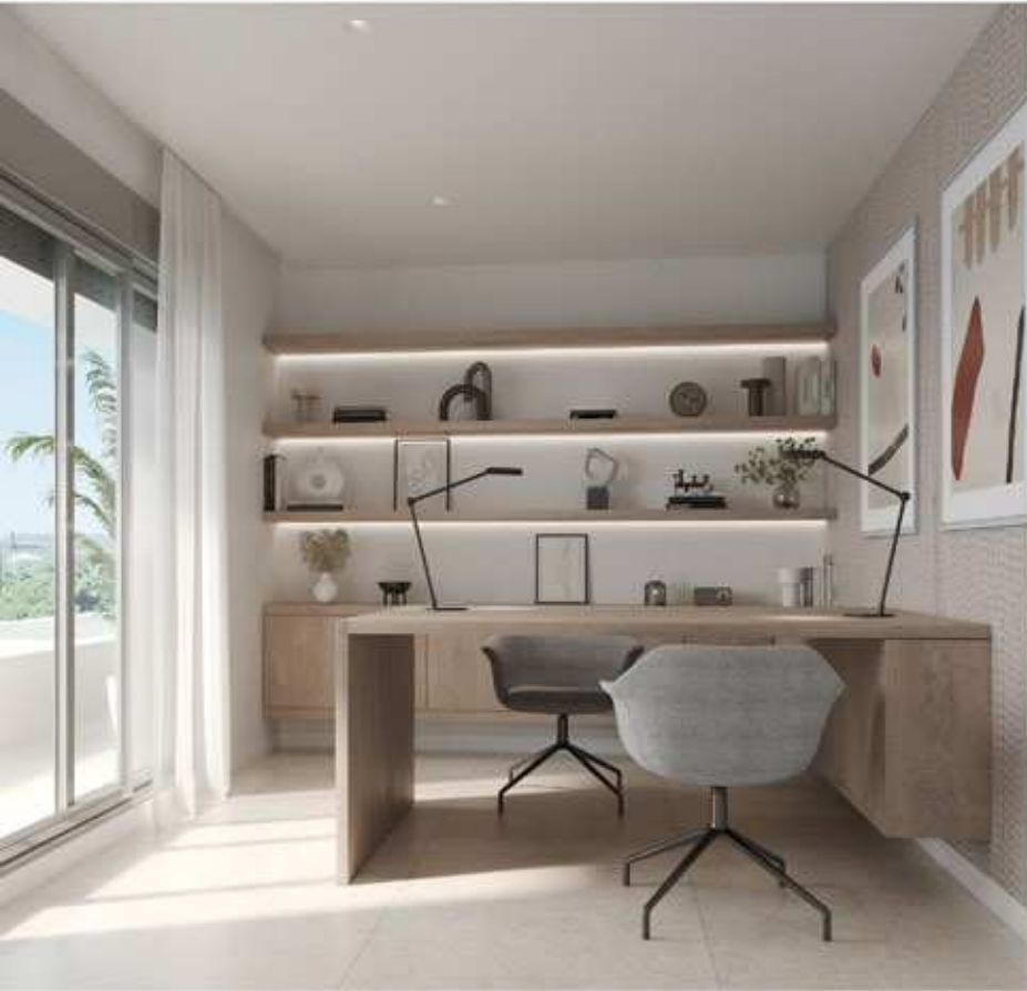
Elegance option in office area