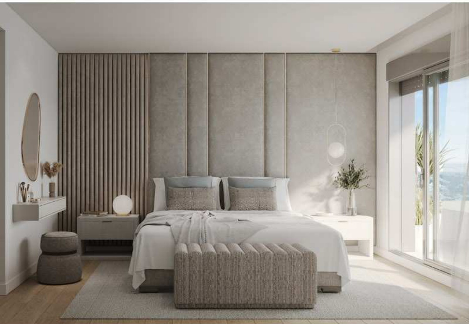
Elegance option in the bedroom